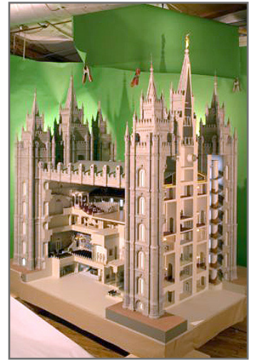
Salt Lake Temple, Salt Lake City, Utah.