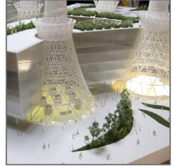
Masdar Headquarters, Masdar City, UAE.